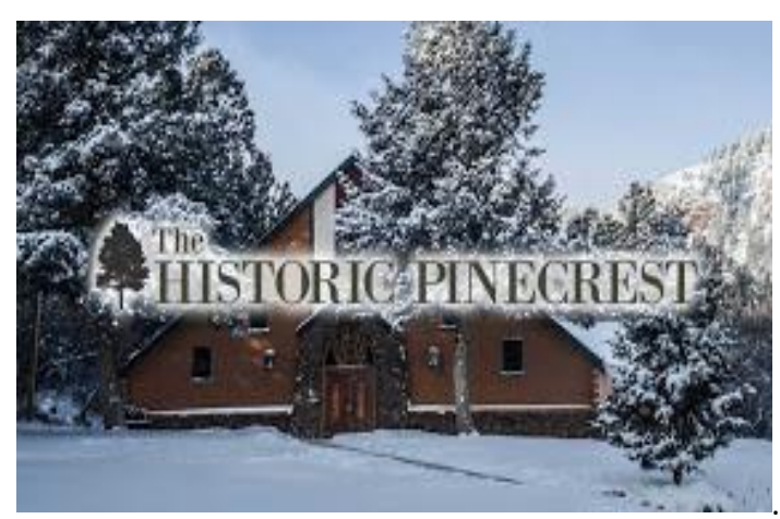
...in Palmer Lake