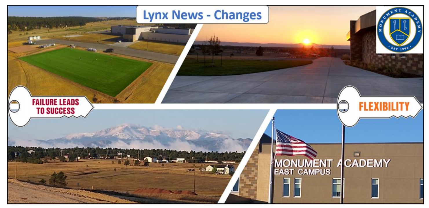
East Campus Edition - October 14, 2020

Many things have changed for Monument Academy families this year. We opened our beautiful new campus for our secondary students, we had our first snow days of the year in early September , the sunsets are coming earlier each night, and just recently we were able to introduce our students to our beautiful, new turf field! We have been busy trying to reimagine new policies, procedures, tactics, and routines specific to our new building and learning environments, all the while considering new and ever-changing county and state guidelines surrounding Covid-19. The effort to establish new routines has been immense and everyone associated with MA has been affected in some way by these changes. I am thankful for the grace and encouragement we have received from our families and I am proud of the work everyone has directed towards assuring our students and families have the best experience possible at MA.