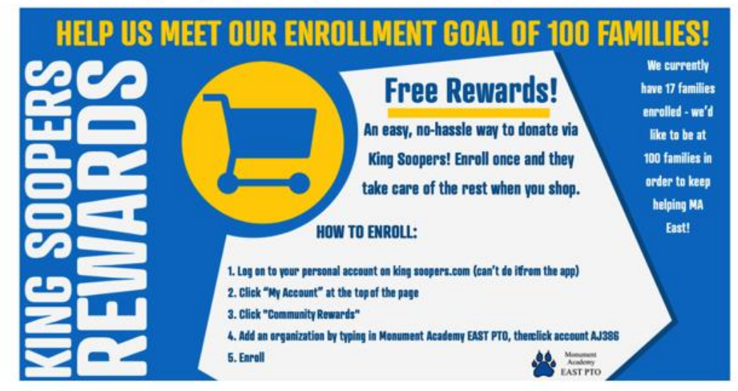
King Soopers Account for Monument Academy EAST PTO - AJ386

If you no longer have kids enrolled in Elementary School, please consider signing up to help the Middle & High School East PTO.