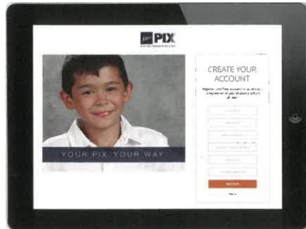
CREATE AN ACCOUNT

VIEW YOUR PHOTOS ONLINE A FEW DAYS AFTER PICTURE DAY AT JOSTENSPIX.COM