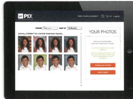
PREVIEW YOUR PHOTOS

For immediate access to your student's photos, use the email address you provided to your school. If you don't see your photos in the gallery, go to Find Your Student and enter your event code.