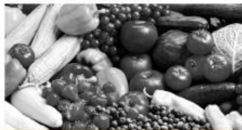
FUELING TO WIN - SMART SHOPPING STRATEGIES AND TIPS TO MAXIMIZE PERFORMANCE

This week in PE all students are reviewing "Fueling to Win - Smart Shopping Strategies and Tips to Maximize Performance". This article as well as another nutritional infographic discusses how to shop smart and the importance of fuel consumption timing. For a young person, it's true a good breakfast/snack in the morning is critically important to get young people on the right track for the day and helps lessen the effects of blood sugar (energy) spikes (highs and lows). We're aiming for steady energy all day!